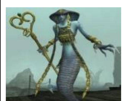
Douay-Rheims Bible... ...lamia...[Isaias 34:14].

The myth: The viper woman kidnaps kids and sucks their blood till death.