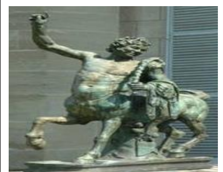
Latin: Biblia Sacra Vulgata ...onocentauris... [Isaias 34:14].

The myth: a creature whose lower part is the body of Atan and the upper part is the body of human.