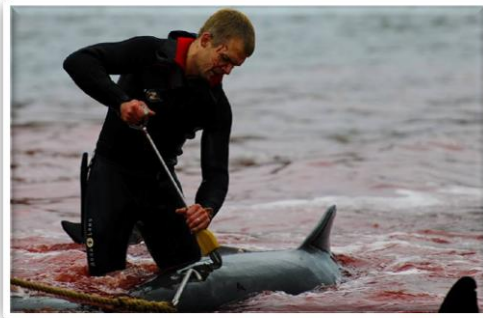
Pithing for a whale

(Pithing) has been criminalized since 2001 for fear of transmission of mad cow disease.